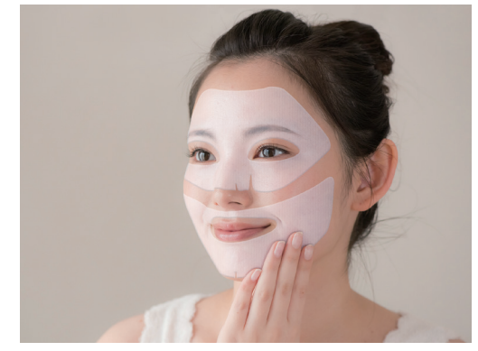
Cosmetic mask usage example

"ST-gel" is widely used as a mask material for skincare that is gentle on the skin. Sekisui Kasei has commercialized its own cosmetic masks that have high adhesion and provide continuous moisturization to the skin, and has also provided support for OEM. Conventionally, sensual expressions such as "gives fresh and moist feeling" are used to describe the feeling of use in the evaluation of cosmetic masks, so it took time to match customer demands with formulation development, which became a development issue.