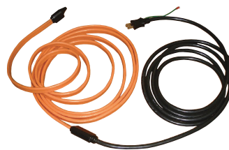
“TECHEATER,” heater can be used for snow melting, freeze protection, temperature control, and other applications.

By combining the PTC effect of semiconducting barium titanate with plastic thermal insulation material, he has developed a long, flexible, self-output-controlled heater that could not be realized with conventional resin-based PTC heaters.