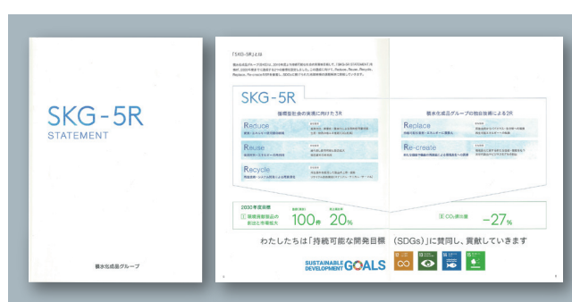
SKG-5R STATEMENT booklet

* "SKG" is an initialism for Sekisui Kasei Group.